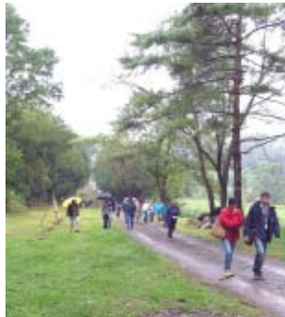
The hill traveled by World Canal Conference members is the same incline that was once part of the Morris Canal system. “Trucks” pulled uphill by a turbine-powered wire rope pulley system held the canal boats. At the summit, the truck delivered the boat into the canal and the boat continued its journey to Newark.