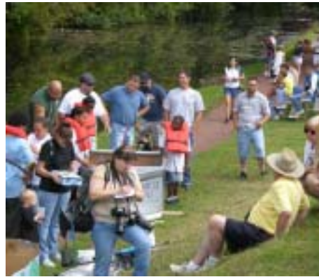
200 people cheered on paddlers for six homemade boats at the first annual “Float Your Boat” community event on Sand Island in Bethlehem, September 10. The event marked the beginning of the international 2006 World Canals Conference.

Another tour took delegates along the Delaware Canal in Pennsylvania and the Raritan Canal in New Jersey for a look at the Groundhog Lock in Raubsville, Lock #11 in New Hope and the Prallsville Mill Complex before finishing the evening with dinner and jazz music at the James A. Michener Art Museum in Doylestown. Post-conference tours were also popular.